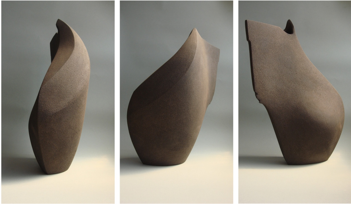
Negro B Black stoneware 56 cm x 37 cm x 16 cm © Sophie-Elizabeth Thompson

Opening: Thursday May 18 th 2017 at 7.30 p.m.